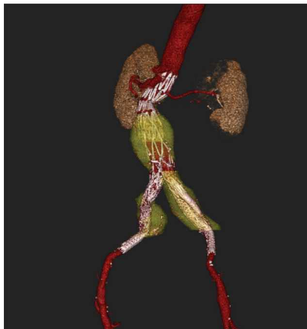
Figure 2. The sandwich/double-barrel/internal iliac snorkel technique.

The bell-bottom technique, also known as the flared limb technique , may currently be the most commonly used technique to preserve flow into the IIA during EVAR, particularly now with the increased availability of larger-