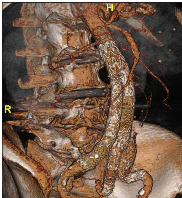
Figure 5. The GORE® EXCLUDER® Iliac Branch Endoprosthesis.

Branch Component features pre-cannulation of the IIA gate, which aids in ease of use. The devices also offer a broad treatment range, including an EIA treatment range of 6.5 to 25 mm and an IIA treatment range of 6.5 to 13.5 mm. The IBE is designed to be used with the GORE EXCLUDER Device, a AAA endograft with extensive commercial worldwide experience. Overall, the features and design of the IBE offer an all-in-one, user-friendly system that can preserve blood flow to the IIA while providing a durable solution for aneurysm exclusion.