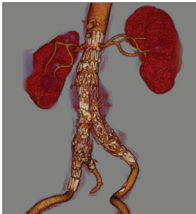
Figure 6. The COOK® ZENITH® Iliac Branch Endoprosthesis.

Through 6 months, the results from the United States clinical trial demonstrate that the device offers an effective treatment for these patients with common iliac or aortoiliac aneurysms. Based on site-reported data for 62 patients enrolled during the primary enrollment, the United States clinical trial has shown an overall technical success rate of 95.2%, with an average procedure time of 151.8 minutes for implantation of both the IBE and GORE EXCLUDER Device (Figure 5). There have been no AAA enlargements (0%) reported through 6 months, with 100% patency of the EIA and 95% patency of the HA at 6 months. Additionally, there have been no reports of buttock claudication (0%) on the IBE treatment side and no reports of new-onset sexual dysfunction (0%). There was one reintervention through 6 months to address an EIA dissection distal to a bare-metal stent that was placed as a distal extension to the IBE during the index procedure. These data points are supported by commercial European experience, with reports demonstrating high technical success and positive clinical outcomes while avoiding complications related to sacrificing blood flow to the HA. 25,26