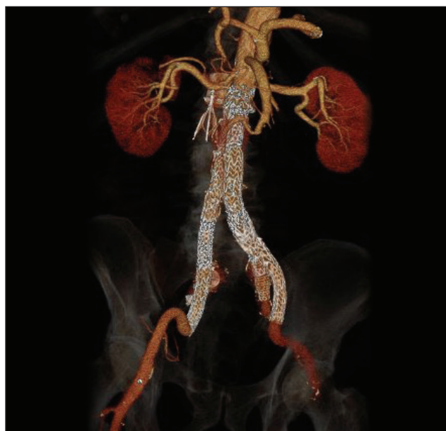
Figure 4. A trifurcation.

The GORE® EXCLUDER® Iliac Branch Endoprosthesis (IBE) is based upon the GORE® EXCLUDER® Device platform and has a modular concept of an iliac branch component mated to a bridging stent into the HA. The device is composed of two components: the Iliac Branch Component and the Internal Iliac Component. The Iliac Branch Component can be repositioned during deployment (via a two-stage deployment) to aid in internal iliac artery cannulation and to ensure accurate device placement. Additionally, the Iliac